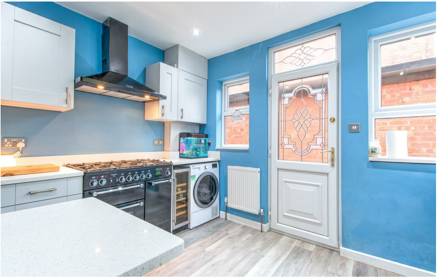
AN EARLY 1900'S BOX BAY FRONT FOUR BEDROOM VICTORIAN SEMI DETACHED HOUSE.

Robert Ellis are delighted to welcome to the market this extremely well presented altered and upgraded early 1900's four bedroom box bay front Victorian semi detached house situated within this favoured and established tree lined residential no through road location.